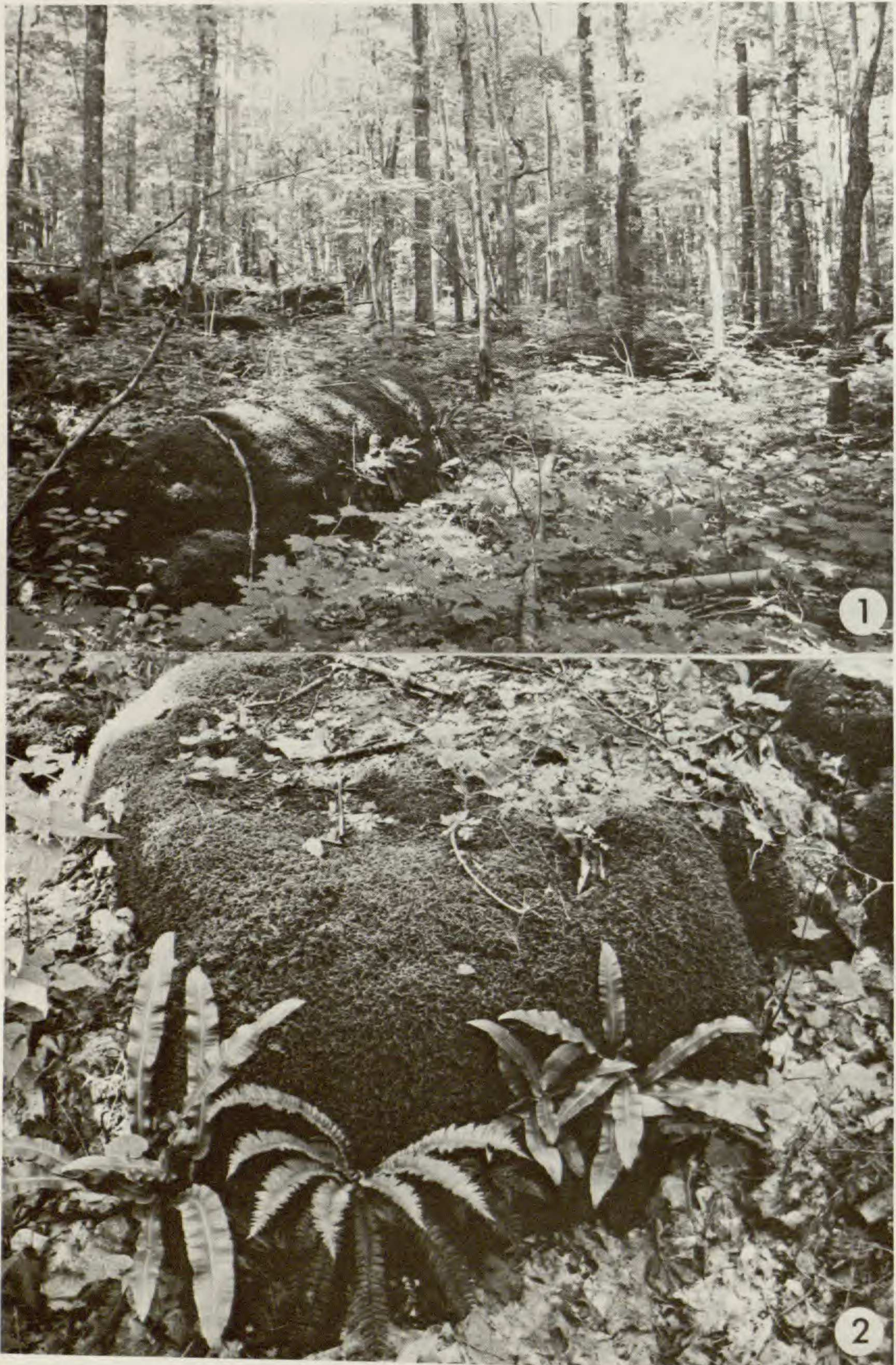
FIG. 1. General view of part of the East Lake station of Phyllitis scolopendrium , Mackinac Co., Michigan. A group of the ferns is growing on the side of the boulder in the central foreground. The map tube (horizontal) in the right foreground is 65 cm long. FIG. 2. Phyllitis scolopendrium growing on a low boulder, along with Polystichum lonchitis and Geranium robertianum on top of boulder.